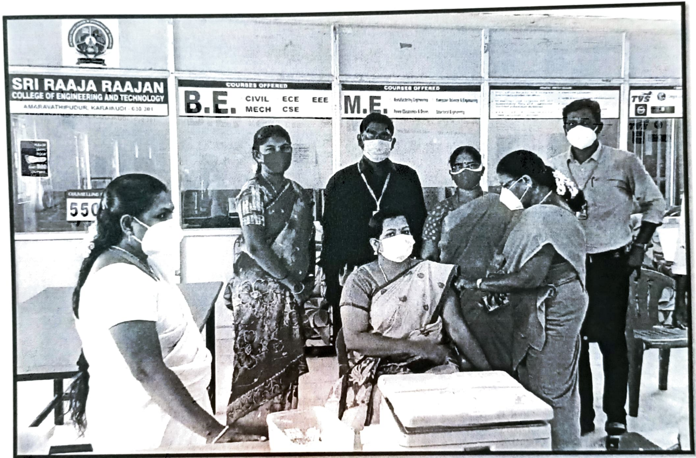
COVID VACCINATION CAMP