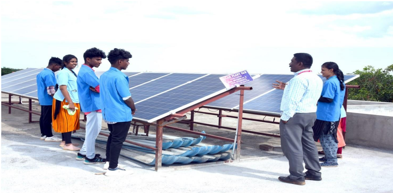
5KW Solar Plant on 2023-2024