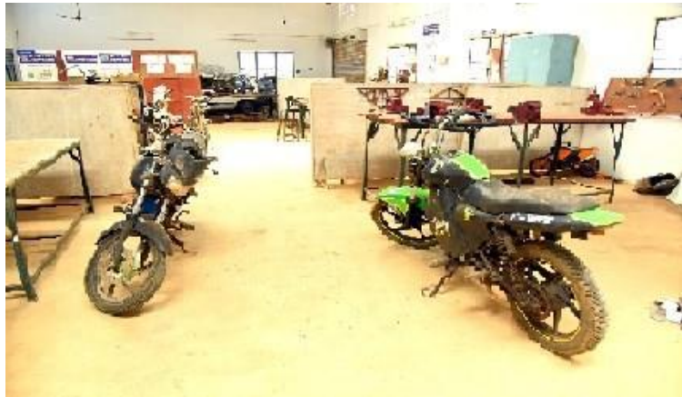
Solar bike on 2020- 2021