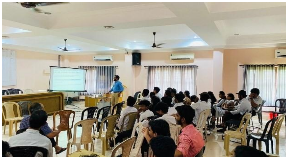
Workshop Electric Vehicle on 20.9.2022