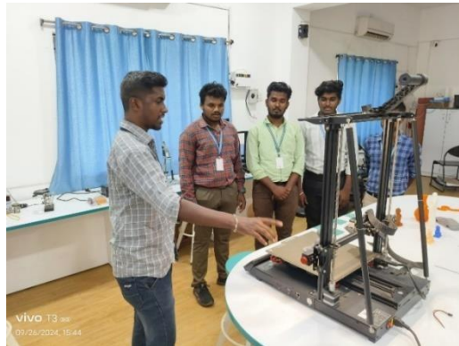
3D printing & robotics workshop